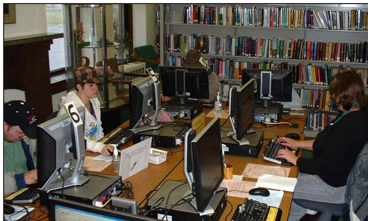
A $101,569 Foundation grant to the North Country Library System provided the local share for a Gates Foundation grant to purchase computers for 43 eligible libraries in Jefferson, Lewis and St. Lawrence counties. 17 libraries in St. Lawrence county received funds, including the Reading Room Association of Gouverneur, shown above.