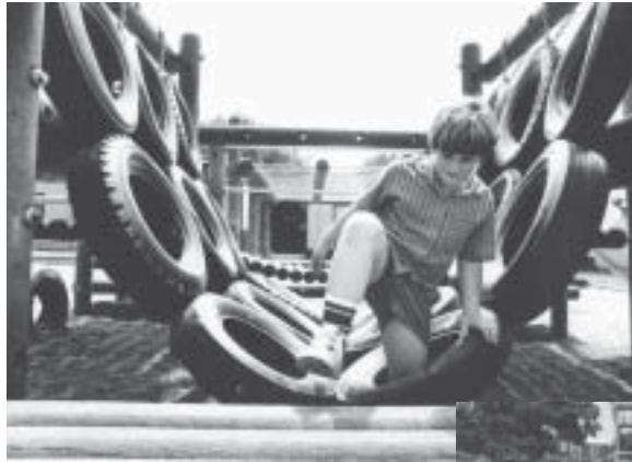
The playground at Indian River School