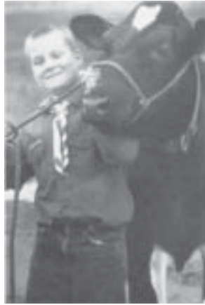
A future farmer with his new heifer.

2002 – Hearts for Youth $11,000 for an Alexandria Bay area youth program