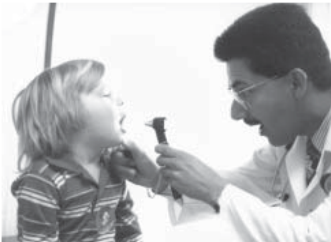
North Country Children's Clinic - Over the years the Foundation has awarded many grants to establish health care clinics for children in the North Country.