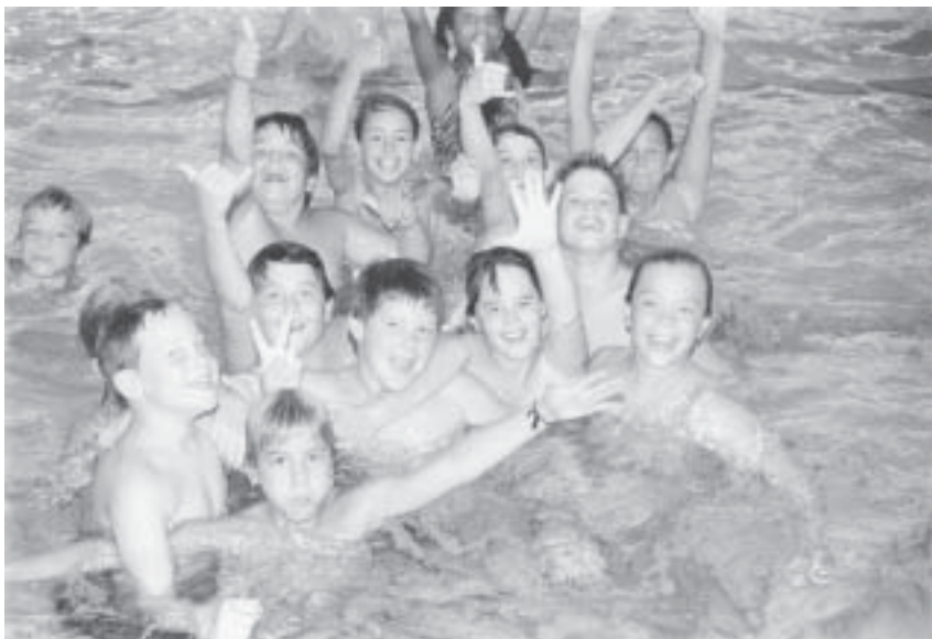
Participants in the School Aged Childcare Program sponsored by the Watertown Family YMCA.