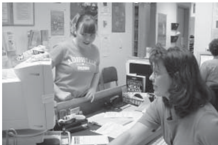
The North Country Children's Clinic school based health center at Watertown High School.