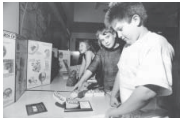
A Foundation grant funded a tobacco education program carried out by the American Lung Association.