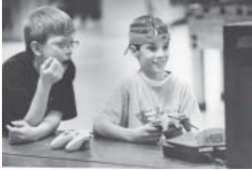
Happy participants at the Branaugh Memorial Youth Club in Carthage.