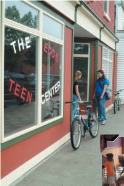
The Edge Teen Center in Adams.

Since 1980, the Northern New York Community Foundation has provided more than $8,600,000 in grants that helped to create opportunities for children.