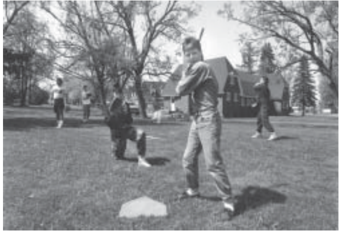
A baseball game at the Children's Home of Jefferson County.