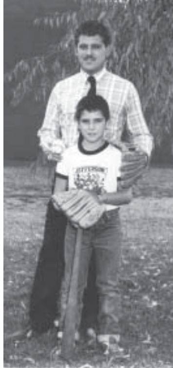
The Foundation has provided many grants to Big Brothers Big Sisters to expand their mentoring program.