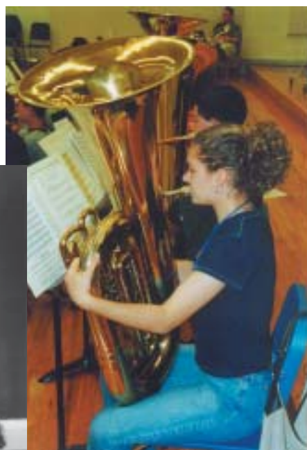
A student at the Crane Youth Music summer camp.