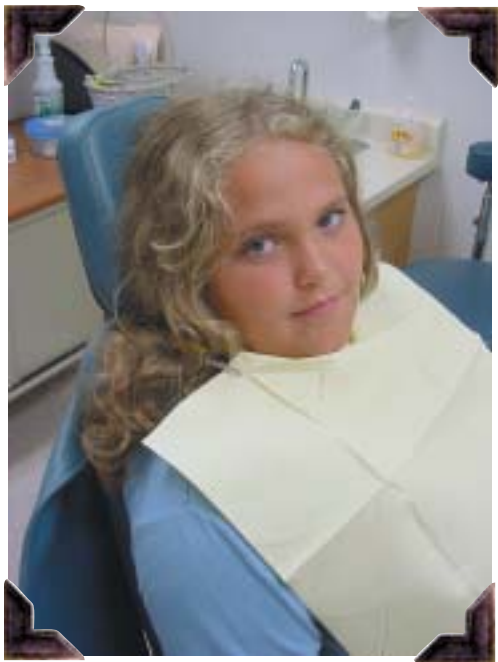
A patient at the Lowville Dental Clinic, opened with a Foundation grant to Lewis County Public Health.