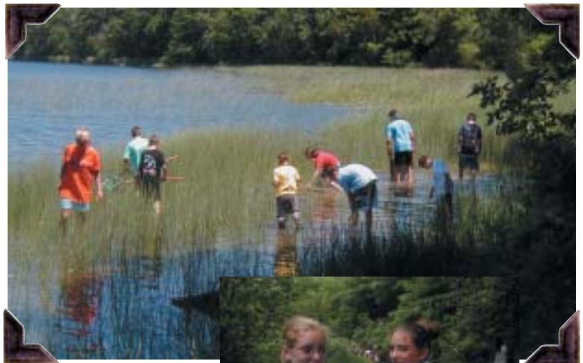
The Foundation has provided scholarships for students to attend the 3C's summer program at Jefferson Community College.